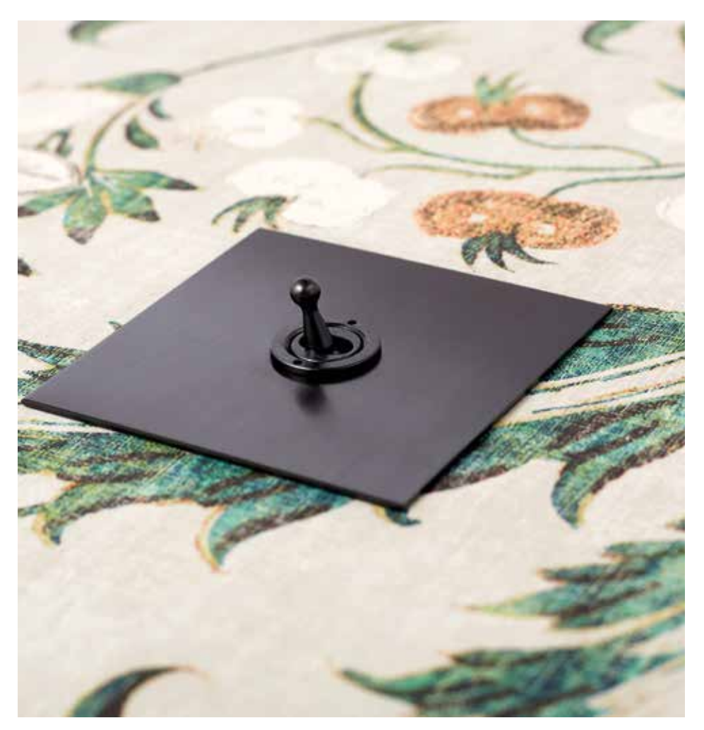
FULLY COMPATIBLE WITH FORBES AND LOMAX MOMENTARY SWITCHES